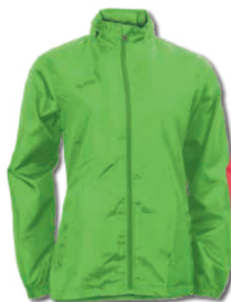
020 GREEN FLUOR