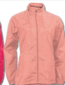
070 SALMON FLUOR