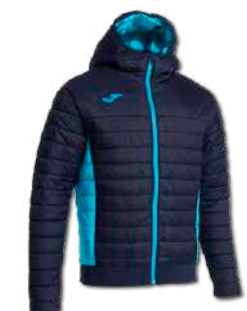
342 DARK NAVY/ TURQUOISE FLUOR