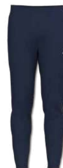
331 DARK NAVY