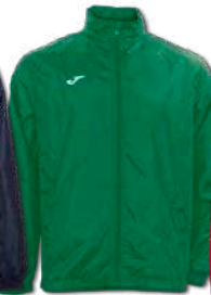
450 GREEN MEDIUM