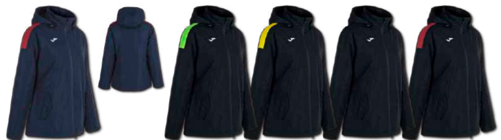
336 DARK NAVY/ RED