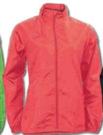
040 DARK ORANGE FLUOR