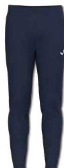
331 DARK NAVY