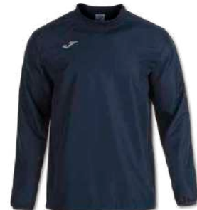
331 DARK NAVY