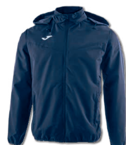
331 DARK NAVY