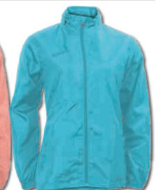
010 TURQUOISE FLUOR