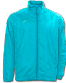
010 TURQUOISE FLUOR