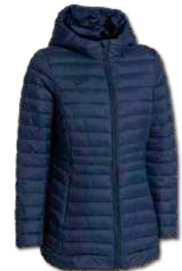
331 DARK NAVY