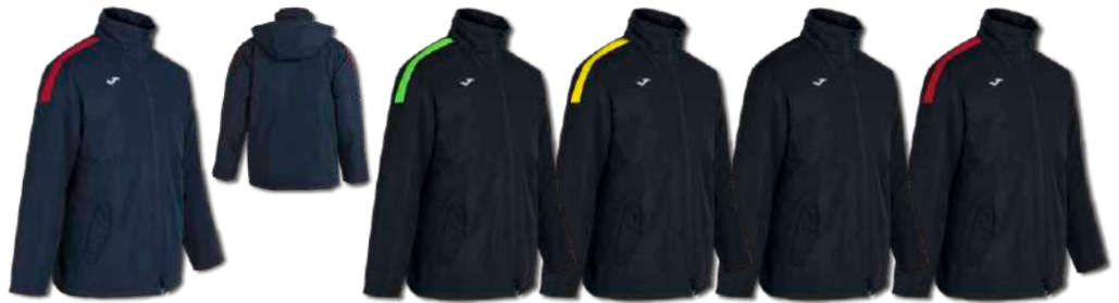
336 DARK NAVY/ RED