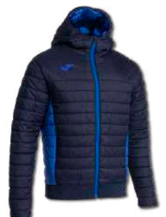
337 DARK NAVY/ ROYAL