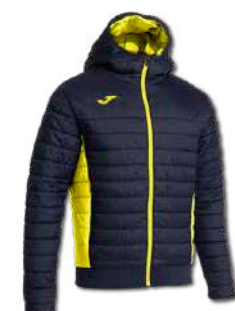
339 DARK NAVY/ YELLOW