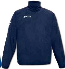
30 DARK NAVY