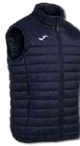
331 DARK NAVY

Padded vest. Featuring a high collar to protect you from the cold and two side pockets with zipper closure. Fitted design made with warm and lightweight fabric. Embroidered Joma logo.