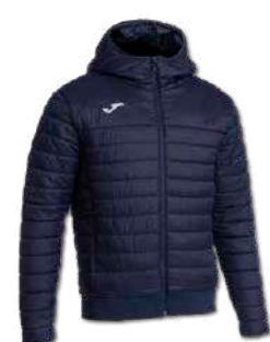
331 DARK NAVY