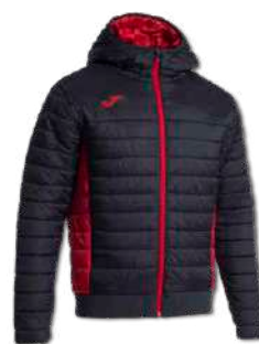
106 BLACK/ RED